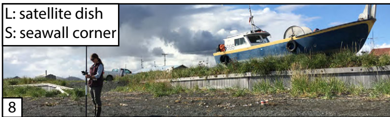
L: satellite dish S: seawall corner