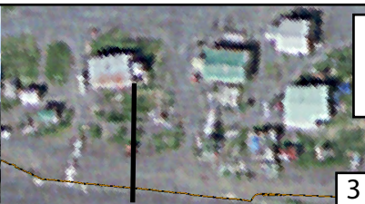
L: House east corner S: stake