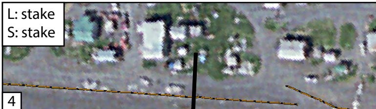
L: stake S: stake