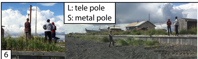
L: tele pole S: metal pole