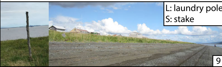
L: laundry pole S: stake