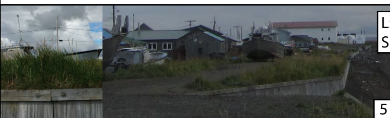
L: tele pole S: seawall corner