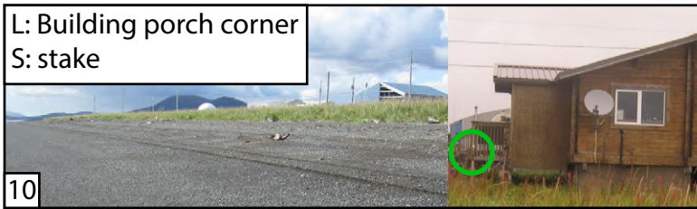
L: Building porch corner S: stake