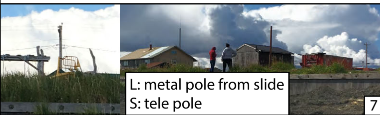
L: metal pole from slide S: tele pole